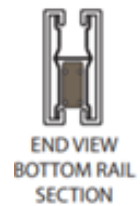
END VIEW BOTTOM RAIL SECTION